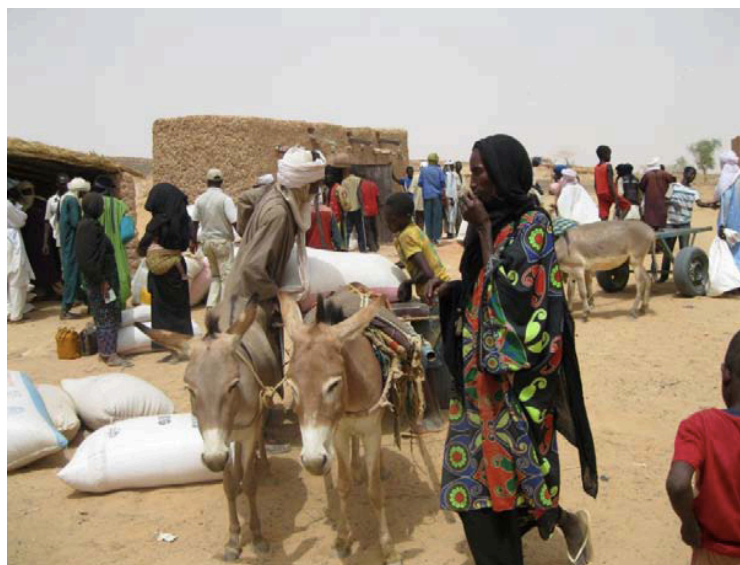
A beneficiary from Tarbiyat (Abala Commune) transporting her food rations on a donkey cart.