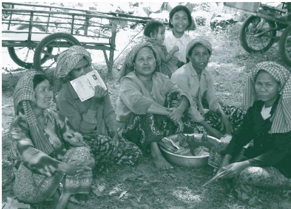
Food for Work program participants attend a food distribution in Kampong Chhnang, Cambodia

FFW serves the double objective of meeting the immediate income and nutritional needs of vulnerable populations, while concurrently promoting the development of essential infrastructure at the community level. Since the advent of regional peace in the early