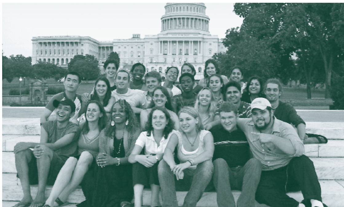
The thirteenth class of Emerson fellows celebrates on the Capitol Steps.

From tutoring elementary school children and recent immigrants to conducting agricultural research in Nepal, members of the new class enter the anti-hunger movement with substantial—and varied—experience to draw on. One fellow interned at the House Hunger Caucus; another taught creative arts classes at a homeless shelter in D.C., and another trained as an emergency medical technician. Whether serving as student body president, as director of a campus American Civil Liberties Union chapter, or on a university's Board of Trustees, fellows have already demonstrated a commitment to public service. They bring diversity to the program, as well: While one studied math in Hungary, another worked as a documentary film producer and yet another conducted street outreach to youth in Chiapas, Mexico. From founding an organic farm to conducting research on rural food insecurity to volunteering on a Hurricane Katrina Response team, new fellows have witnessed the challenges faced every day in the fight against hunger. ●