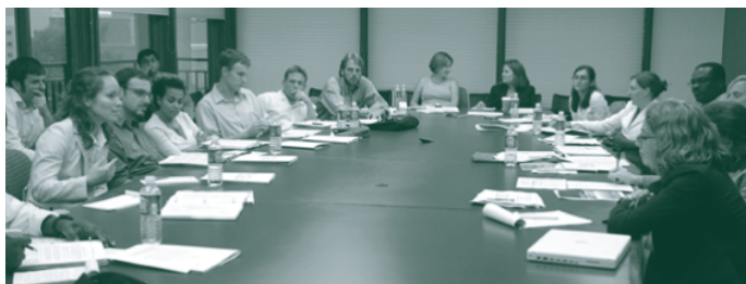
Leland fellows convene at the Johns Hopkins School of Advanced International Studies (SAIS) for policy training.

Fellows also participated in a lively discussion on foreign aid reorganization and the Millennium Challenge Account with experts from the Millennium Challenge Corporation, the U.S. Agency for International Development, Howard University, and the Center for Global Development. In addition to these briefings and media training, fellows presented their field placement work to one another, their policy supervisors, and Congressional staff. CHC