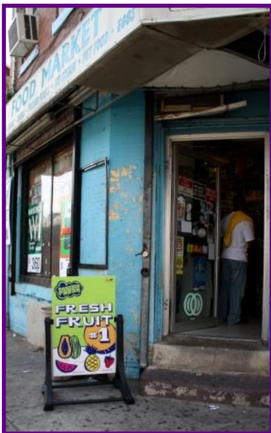
Food store in Philadelphia participating in the Food Trust's Corner Store Campaign.

studies link sales of alcohol with increased crime rates. If we want to help create a healthier environment in our neighborhoods, working with corner stores to help them stock healthy and affordable food is an excellent place to start.